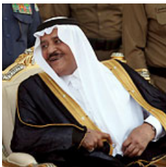
Potential Saudi Prince is Hard-Line but Pragmatic