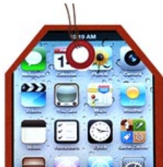
Apple's Lower Prices Are All Part of the Plan