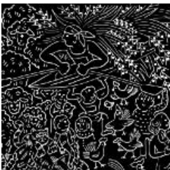
Op-Ed: Seven Billion