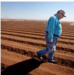
California Farmers Paid Not to Plant